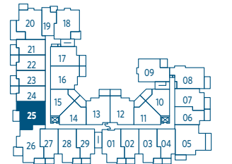
3RD FLOOR AVAILABLE ON 4TH FLOOR